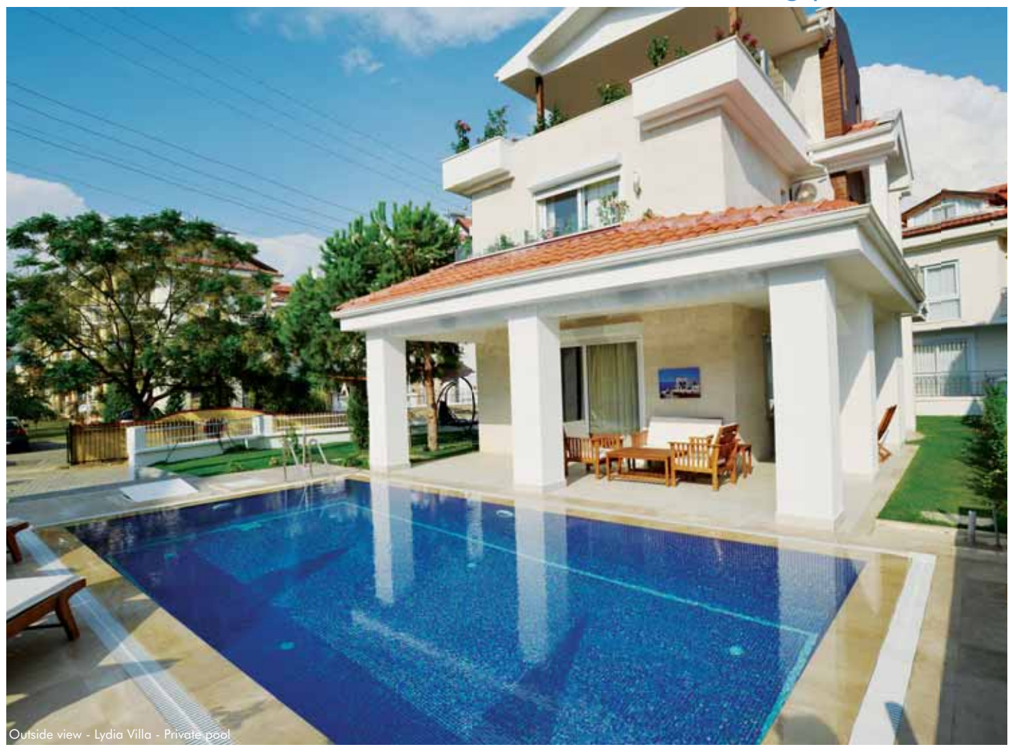
Lydia - 4 rooms 75 meters from the beach - Private swimming pool