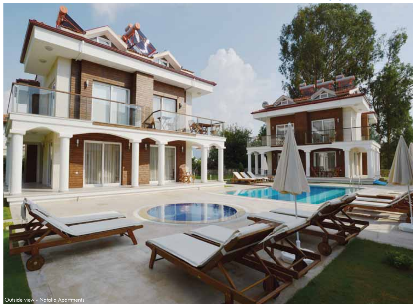
Natalia 600 meters from the beach - Shared swimming pool