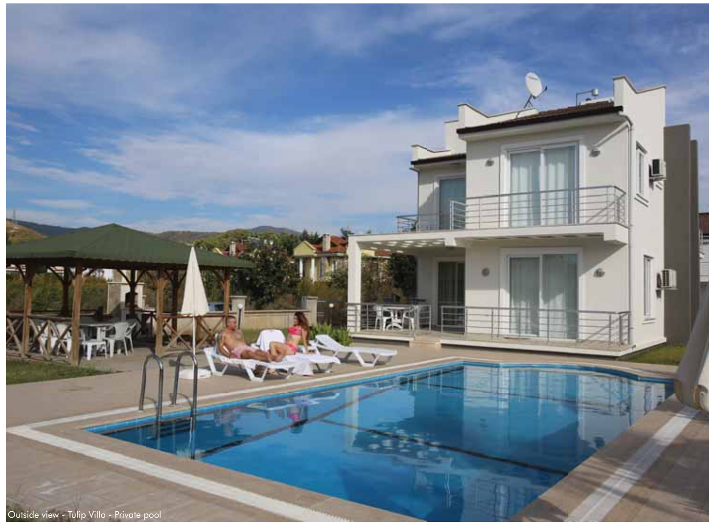
Tulip - 4 rooms 250 meters from the beach - Private swimming pool