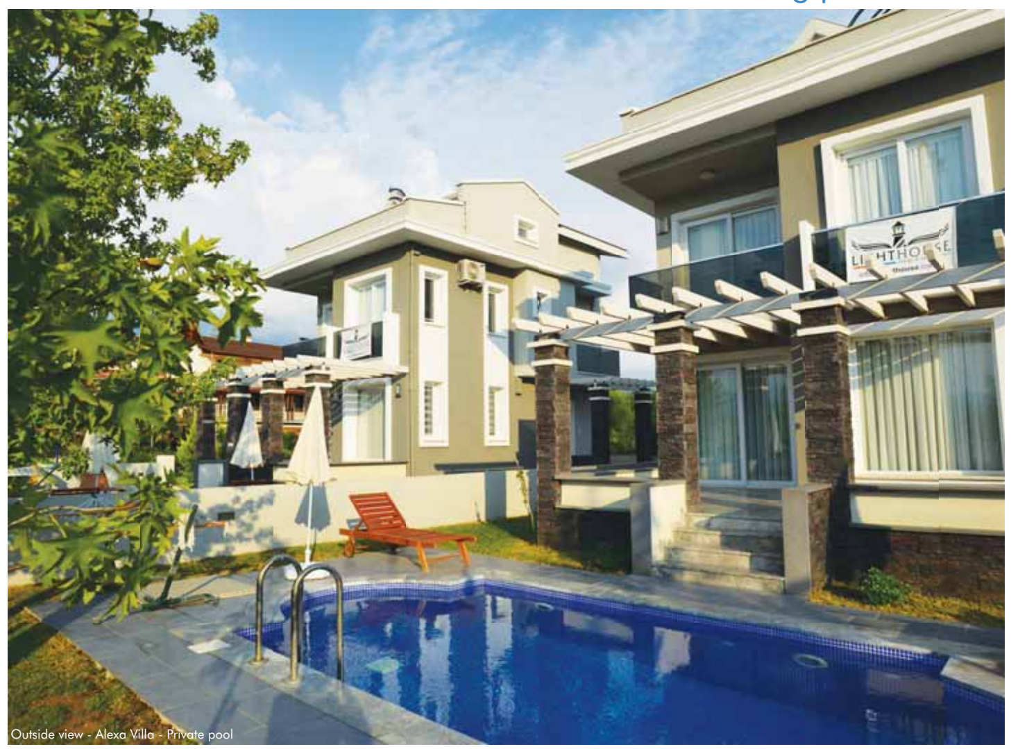
Alexa - 3 and 4 rooms 200 meters from the beach - Private swimming pool