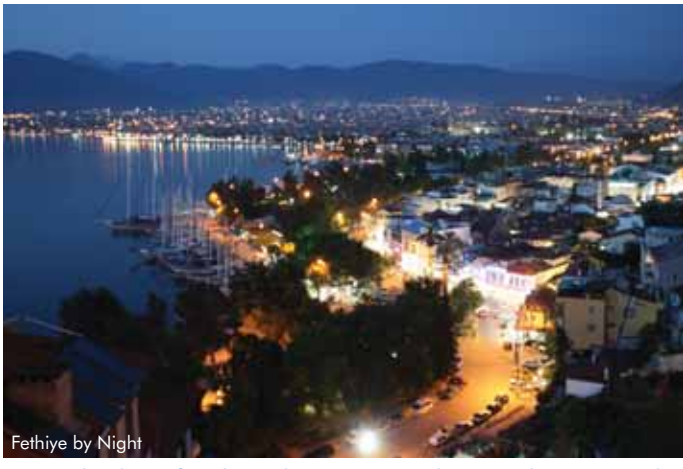
Enjoy the best food on the promenade in Fethiye or in the fish market.