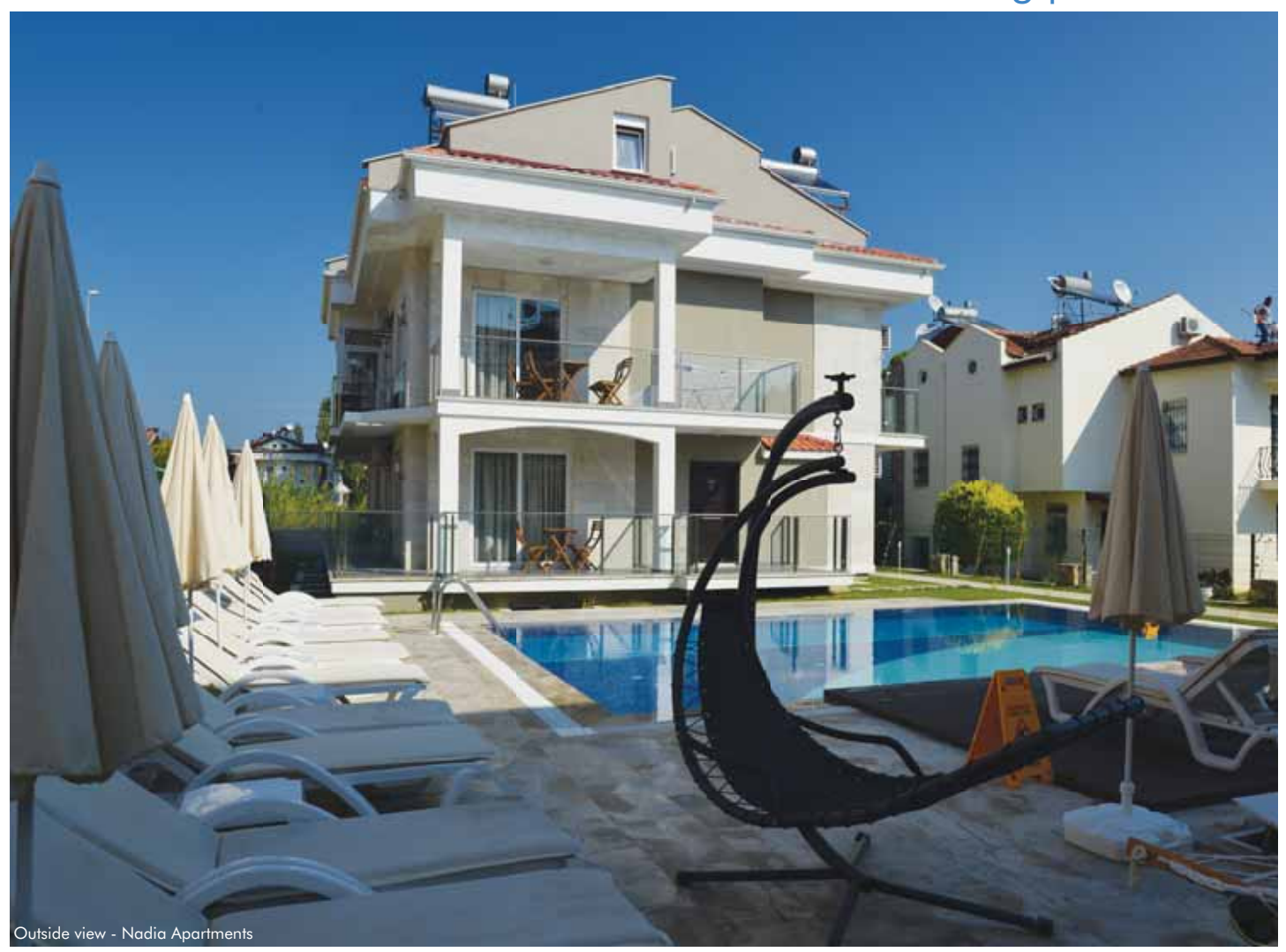
Nadia 600 meters from the beach - Shared swimming pool