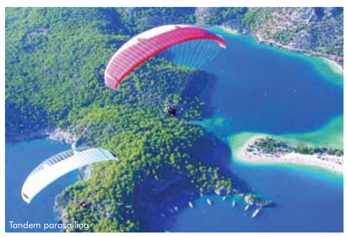
Oludeniz is the world capital of paragliding. It is located at 5 minutes from Fethiye.

Fethiye, a great place where you can enjoy one or two weeks holiday.